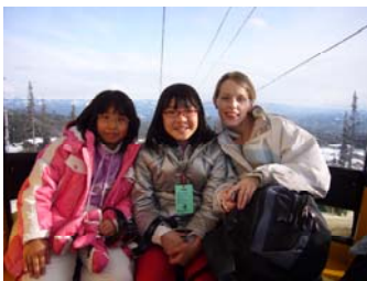
Students had the chance to spend a fun day skiing at Big White. For many, it was a new experience.